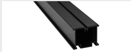
38mm x 48mm