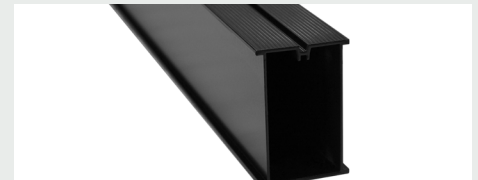
72mm x 48mm