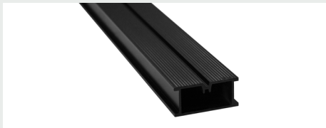
22mm x 48mm